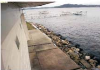
Actual image capture from working camera system on Lake Wisconsin.

OBSERVE actions IDENTIFY perpetrators PREVENT wrongdoing or accidents PROTECT people and property