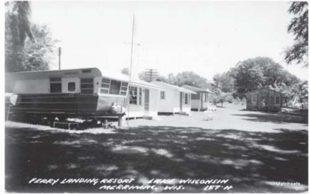
Old resort was located right near the Ferry Landing on Lake Wisconsin